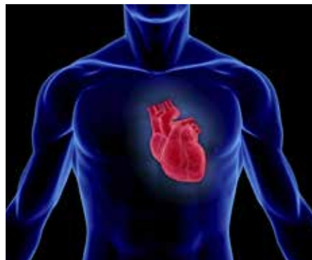
>15mmHg threshold for ROSC