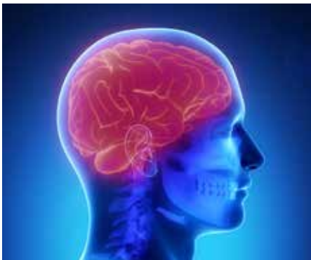
Increased flow to the brain

LUCAS helps sustain blood circulation to the brain, the heart and vital organs.