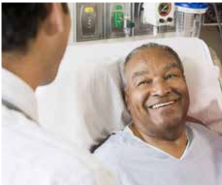
Safe for the patient

LUCAS delivers safe chest compressions for patients and responders.