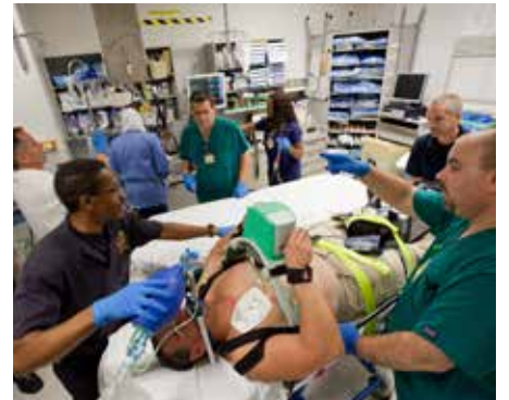
In the hospital