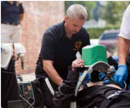
At the scene

LUCAS delivers effective and consistent chest compressions with a minimum of interruptions.