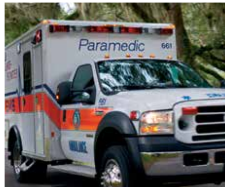
Improved safety during transit