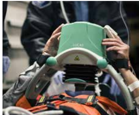
On the move