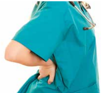
Reduced fatigue and back pain